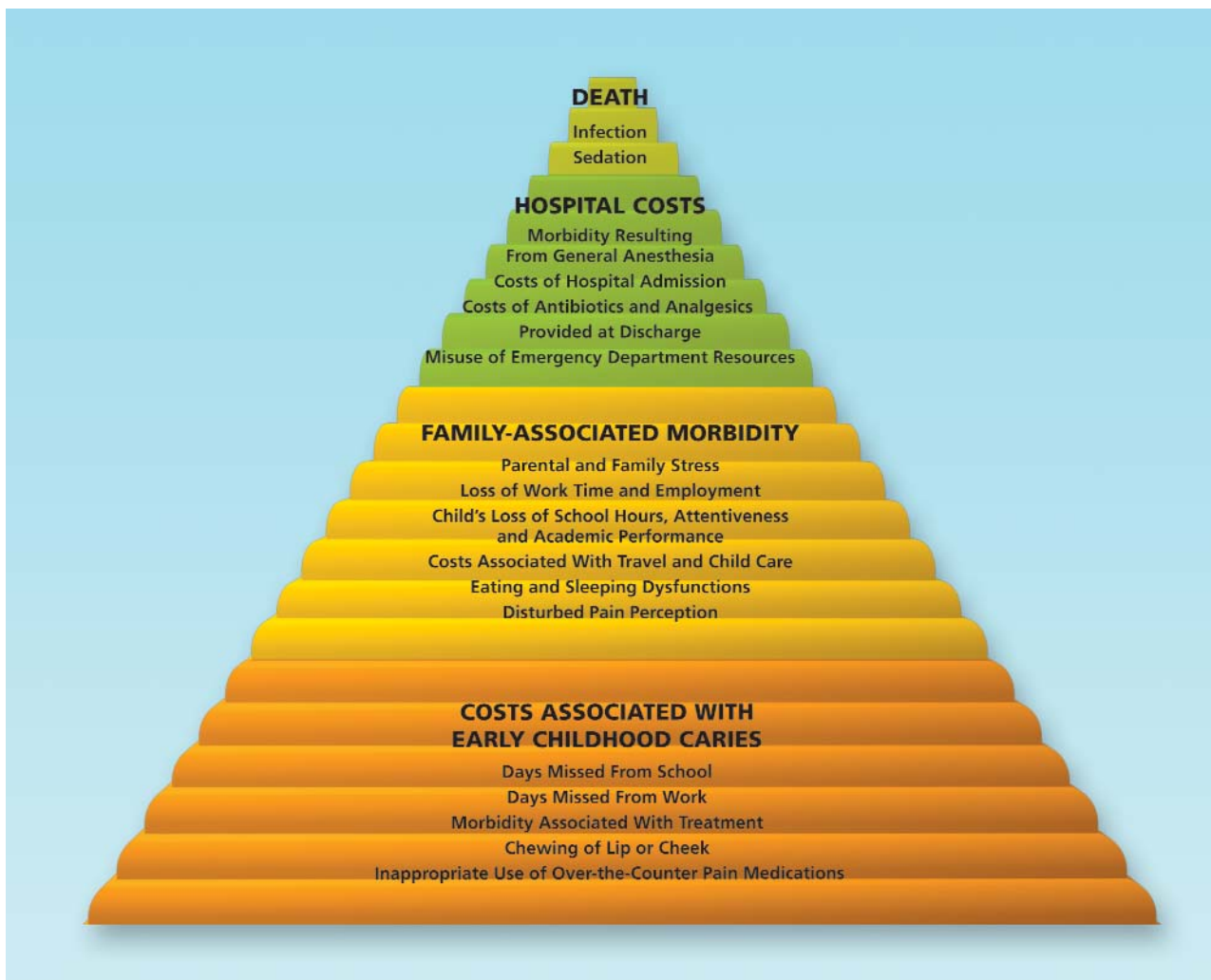
Figure 3. A proposed early childhood caries morbidity and mortality pyramid.

and failure to thrive—a condition of poor growth in young children—in a cohort of low-income children. Body measurements and blood test results indicative of malnourishment are significantly associated with severe ECC and suggest iron-deficiency anemia. 39 These reports and others stimulated interest in the effects of ECC and its treatment on child growth, looking at factors such as dysfunctions in eating, sleeping, mood and attention. Knowledge of the impact of ECC on the development of the child in physical, emotional and intellectual terms is fragmented. Episodic pain from dental caries is well-established as a constant finding, even from an early age, affecting up to 20 percent of preschoolers. 37,39-41